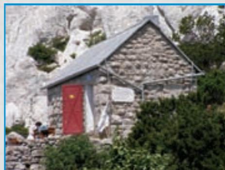
Rossijeva koliba/Rossi's hut

Na stazi ili u njezinoj blizini nalazi se nekoliko planinarskih objekata, koji pružaju sklonište planinarima. Jedan od najpoznatijih je Rossijeva koliba podno Pasarićeva kuka u Rožanskim kukovima. Sa staze se odvaja nekoliko uspona na neke od najljepših vrhunaca sjevernog i srednjeg Velebita - Gromovaču, Crikvenu, Šatorinu i druge.